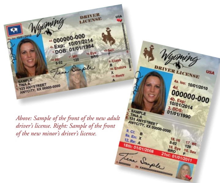
Above: Sample of the front of the new adult driver's license. Right: Sample of the front of the new minor's driver's license.

The WSLA office has been getting a number of questions regarding the new Wyoming driver's licenses and identification cards. As in the prior licenses (but not the oldest ones), if the person is under 21 when the license was issued, it is vertical... if over 21, it is horizontal. The dates that the person turns 18 and 21 (for tobacco and alcohol sales, respectively) are in a red band on the "Under 21" vertical license, as you can see in the sample.